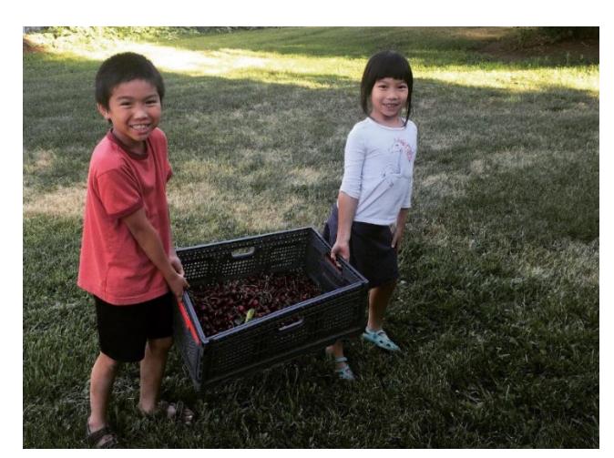
Children volunteer along with their parents on a cherry glean. Community Harvest Gleaning Program volunteers pick thousands of pounds of excess produce each year for distribution at food banks across Chelan and Douglas Counties.