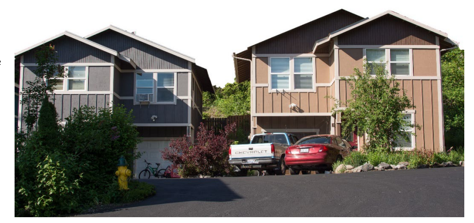
MEND's first affordable homeownership neighborhood – Alpine Heights – was built in 2001. The 10 homes in the neighborhood are permanently affordable, meaning homeowners now and in the future will be able to own these homes for a price they can afford earning local wages.

Over the past decade, the cost of housing in the Upper Valley has increased steadily, outpacing local wages. During and after the Covid-19 pandemic, the cost of housing jumped significantly due to an increased demand for both rentals and homeownership. The lack of affordable rentals and entry level homeownership opportunities impacts every aspect of community life. Local employers struggle to hire staff. Families move out of the area because they can't find a place to live. Seniors find themselves with tax burdens they can't afford long after their homes are paid off. Community morale drops as people feel they can't make a place for themselves in the community they love.