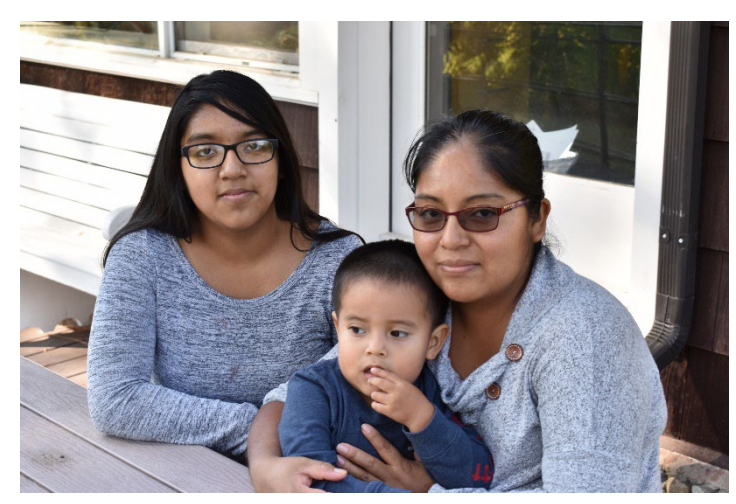
After the home they owned burned in a house fire, Upper Valley MEND's emergency assistance program helped this local family pay for a temporary apartment for 2.5 months.

MEND has been providing immediate and one-time financial assistance for more than two decades. We have seen that many people who reach out to MEND for financial assistance have deeper and more diverse needs than will be met with a rent or utility payment, or a few nights in a local hotel. In 2020, MEND expanded this program with a full-time staff position to manage the emergency financial assistance program. Priorities in hiring included a staff member who is bilingual, bicultural and has a background and educational credentials in social work or a related field.